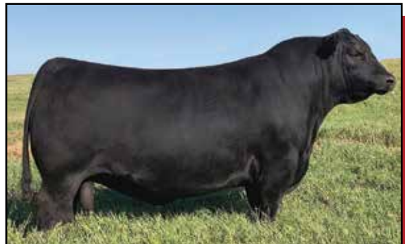
S A V America 8018 Reference Sire