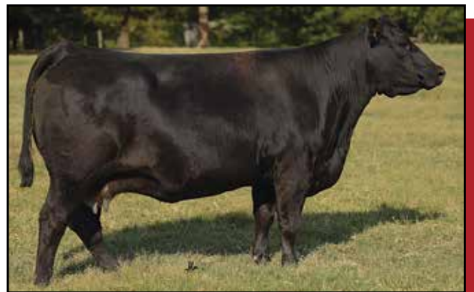
McKellar Enlass Bree 3388 Reference Donor

BW:55 Adj. 205 day WW:633 Super fancy look on this strong topped, sharp made beauty