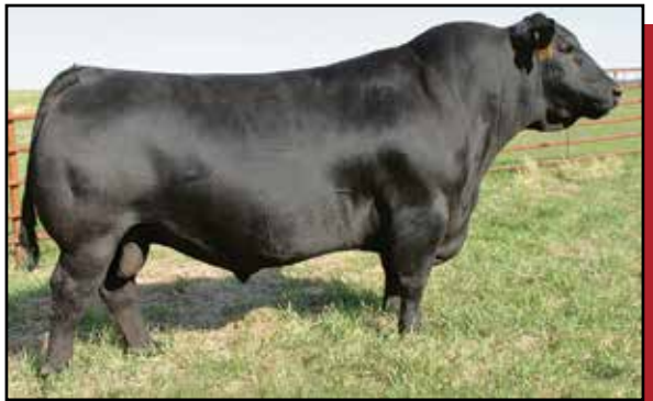
S A V Resource 1441 Reference Sire