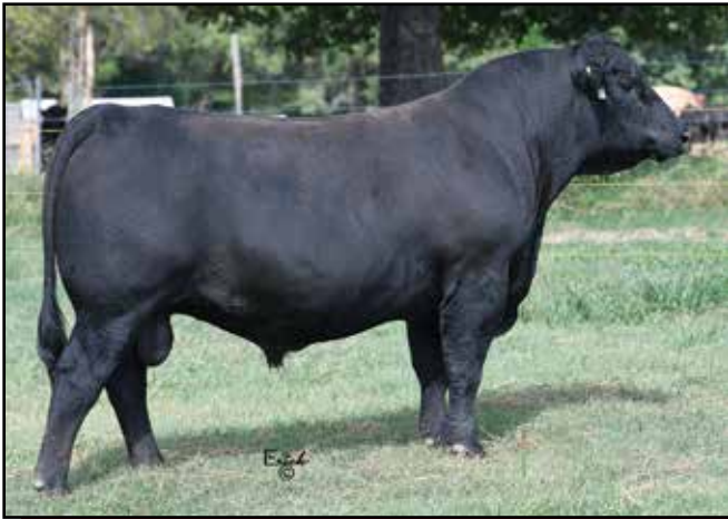
Lot 89 McKellar Resource 0177