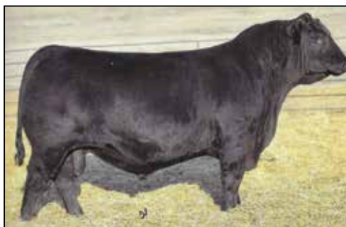
Ellingson Three Rivers