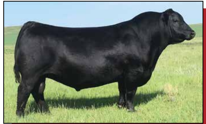
S A V President 6847 Reference Sire

Added frame on this growthy President Dam is the 2012 Connealy Angus Pick of Dams Lots 15, 61, 65 & 85 are flushmates