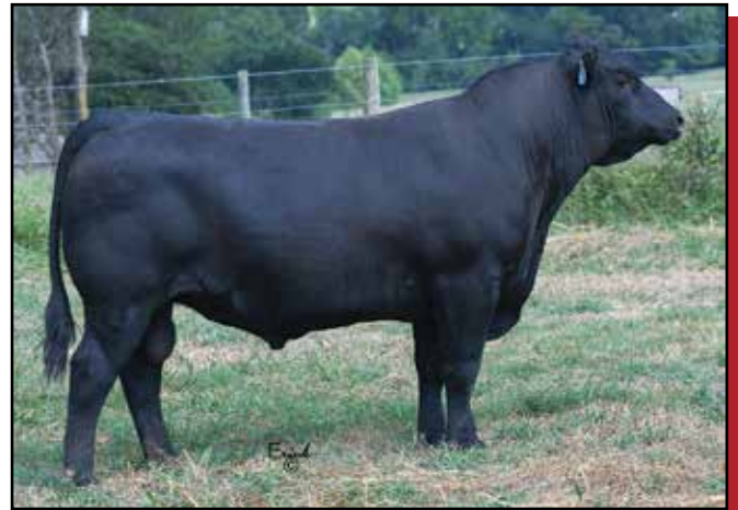
Lot 88 McKellar 316 Capitalist 0167

You'll like the big top in this powerful bull Dam is a powerhouse Connealy United daughter Lots 87, 90 & 92 are flushmates