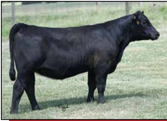
Lot 39 McKellar Pastel Pride 1104