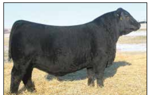
S A V Downpour