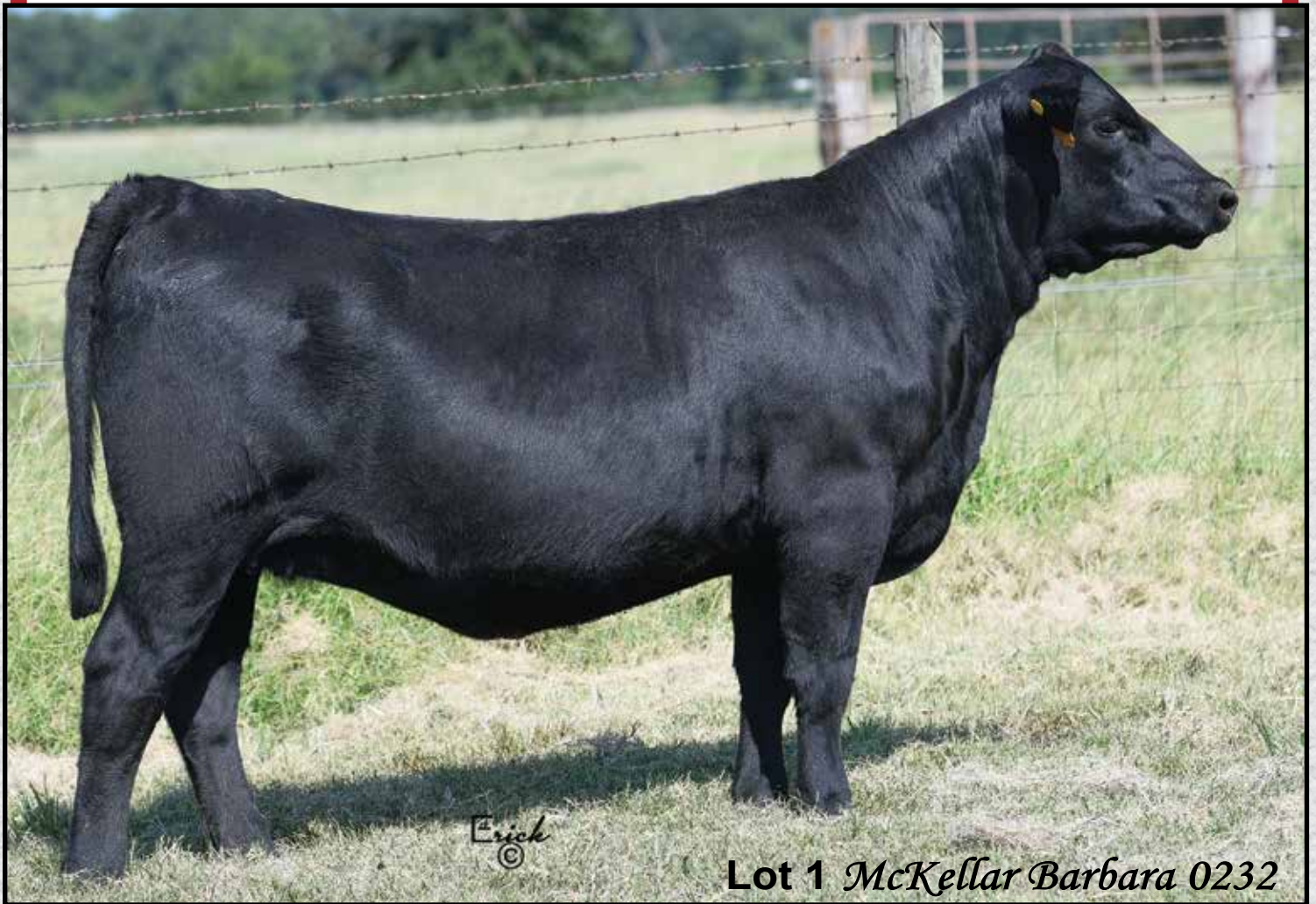
Lot 1 McKellar Barbara 0232