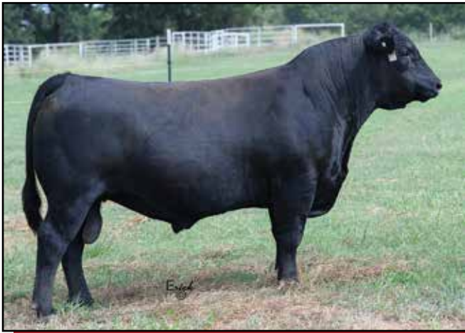
Lot 86 McKellar Resource 0183