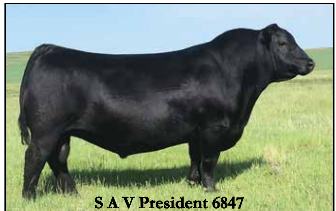
S A V President 6847

This super attractive female is easy to find. Her impeccable structure, natural thickness and striking appearance are unparalleled.