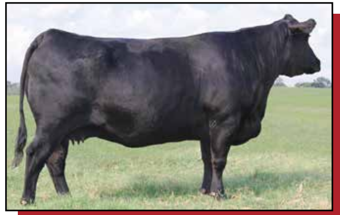
Breesha of Conanga 1251 Reference Donor

Sells bred to: LD Capitalist 316 E.C.D.: 10/8/2021 Fetal Sex: N/A