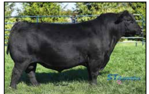
S Powerpoint WS 5503