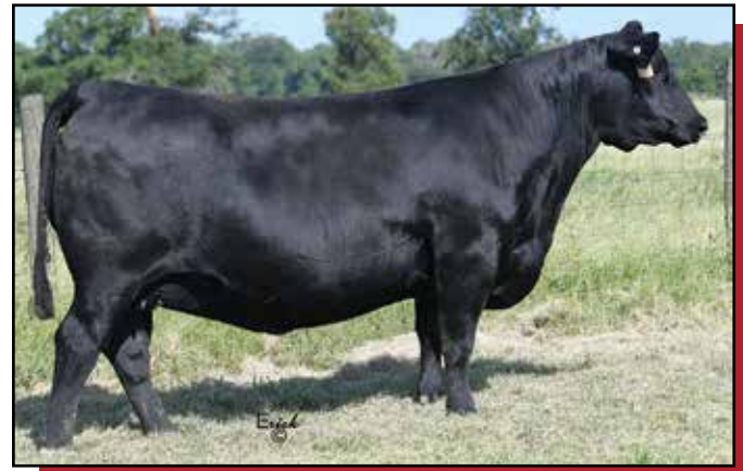
McKellar Executa May 7015 Reference Donor

McKellar Executa May 7015 , sired by SAV Seedstock, is an own daughter of Executa of Conanga 939, dam of Connealy Mentor and long-time Connealy Angus & McKellar Angus donor. A stand out from an early age, she has proven her potential in the stellar productivity. Her striking rib shape and capacity, structure, foot quality and natural body mass are ever present in her progeny. Additionally, she has compiled ultrasound carcass ratios on her first ET progeny of Scan %IMF 108/12 head, Scan RE 105/12 head. Lots 44-45 descend from this female.