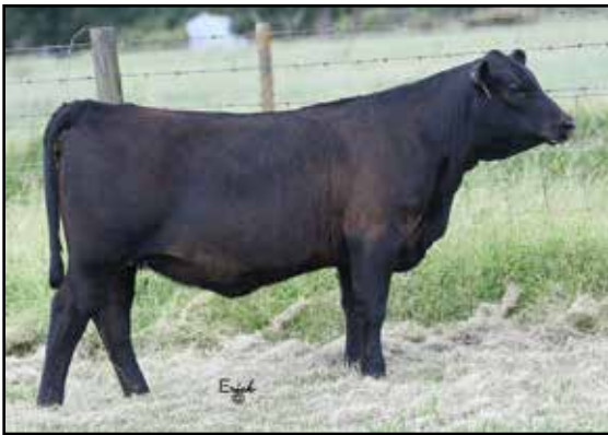
Lot 40 McKellar Pastel Pride 1106

Not often do incredible figures and incredible phenotype combine in one individual - They did here Lots 39, 40 & 41 are flushmates