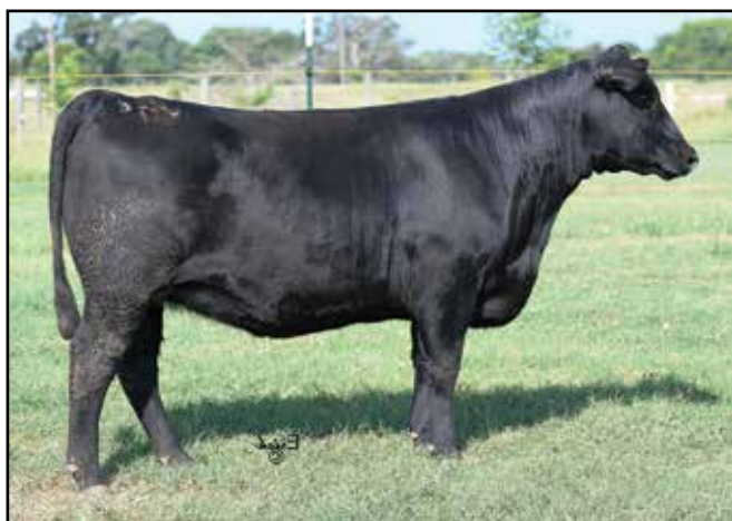
Lot 10 McKellar Barbara 9127

McKellar Breela Pride 5088 is a prolific, proven donor in our program. In her ET production she has compiled impressive ultrasound carcass progeny records- Scan %IMF 109/63, Scan RE 102/63. Her progeny have also excelled in genomic projections, which have subsequently been matched by real world performance. 5088's maternal sister is JMc Beretta 1334, the top income producer in our history. Her dam was also a donor in our program. Lots 10-21 descend from this top notch producer.