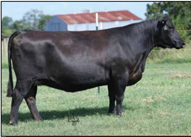
Lot 65 McKellar Blindea Elle 6185