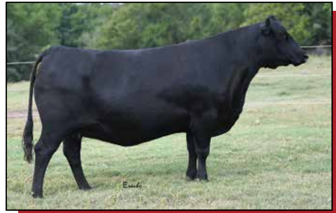
JMc Beretta 1334 W148 Reference Donor

JMc Beretta 1334 W148 is the top income producer in our program. She is far and away the most prolific daughter of the original Connealy Consensus in the Angus breed. Her progeny carcass ultrasound ratios remain strong: Scan %IMF 105 head, average ratio 105, Scan RE 105 head, average ratio 101. Her pedigree combines multiple donor females, who are present in pedigrees of many stud bulls today, as well as, many females featured as donors in our program. Lots 22-38 descend from this matriarch.