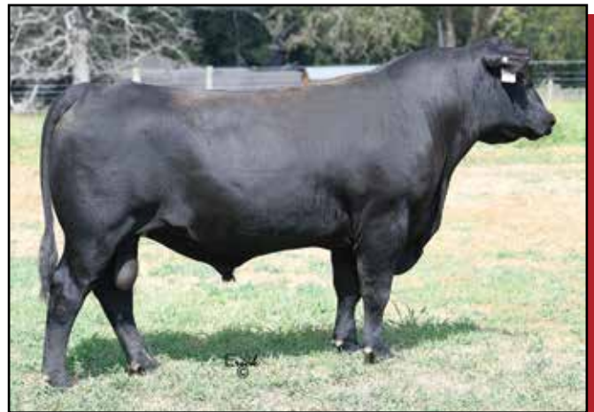
Lot 91 McKellar 316 Capitalist 0133

This good President hits all the mark Dam is powerhouse Connealy United daughter Lots 87, 90 & 92 are flushmates