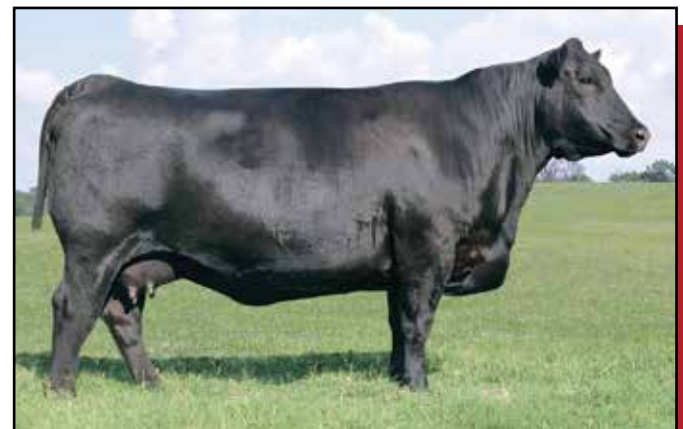
Executa of Conanga 939 Reference Donor

Sells bred to: Deer Valley Growth Fund E.C.D.: 2/8/2022 Fetal Sex: Bull