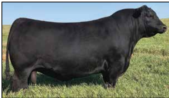
S A V America 8018 Reference Sire

One can see the genetics of phenotype combine in this incredibly deep sided youngster Lots 55-58 are flushmates