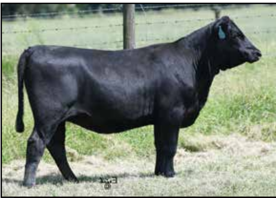
Lot 30 McKellar Barbara 1120

This stellar figured female is solid from all angles with all the tools to be a great one Lots 29, 30, 31, 32 & 33 are flushmates