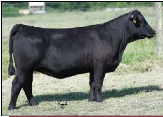
Lot 54 McKellar Blackbird 0288