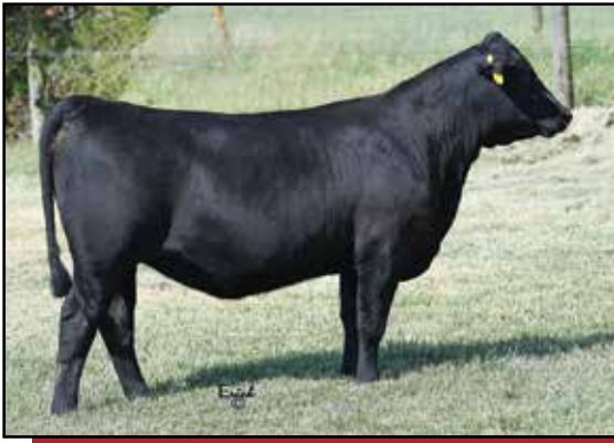
Lot 29 McKellar Barbara 1115

29 McKellar Barbara 1115 Open Heifer Tattoo:1115 D.O.B.1/12/21 Reg. No.20028440 #Coleman Charlo 0256 Barbara S A V President 6847 S A V Blackcap May 4136 S A V America 8018 #S A F 598 Bando 5175 S A V Madame Pride 0075 S A V Madame Pride 8264 #Connealy Consensus #KMK Alliance 6595 187 JMc Beretta 1334 W148 Blinda of Conanga 004 K C F Miss Protege W148 #GAR-EGL Protege Breela of Conanga 3991