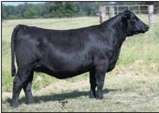
Lot 1 McKellar Barbara 0232

1 McKellar Barbara 0232 Open Heifer Tattoo:0232 D.O.B.10/6/20 Reg. No.20017674 S A V Rainfall 6846 #Coleman Charlo 0256 Barbara S A V Downpour 8794 S A V Blackcap May 4136 #S A V Resource 1441 #S A V Madame Pride 4407 S A V Madame Pride 0235 #Connealy Consensus #KMK Alliance 6595 187 Britta of Conanga 157E Blinda of Conanga 004 #Britt of Conanga 1251 877N #Connealy Thunder #Breeta of Conanga 525