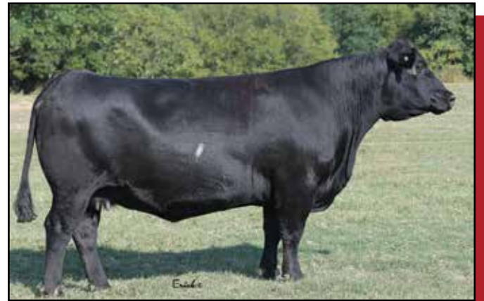
McKellar Brazen Pearl 3335 Reference Donor

Not to be out done - This sharp made Ashland's projections give her herd building potential Lots 39, 40 & 41 are flushmates