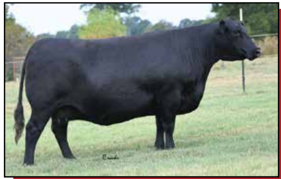
Britta of Conanga 157E Reference Donor

Britta of Conanga 157E was purchased as the Fall 2016 Connealy Angus Pick of Dams. She is the mother of Connealy Cade, the high selling bull of the Fall 2016 Connealy Angus Bull Sale. 157E is a model Angus female and has become a tremendous producer in our program being the dam of several sale topping progeny. Lots 1-9 all descend from this truly elite female.