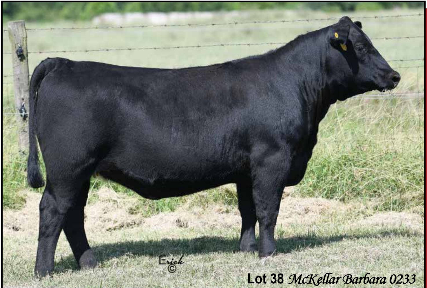
Lot 38 McKellar Barbara 0233

McKellar Brianna 4095 , sired by Connealy In Focus 4925, is an own daughter of JMc Beretta 1334. She is powerfully made with an enormous hip. 4095 produces very consistently. Her progeny are growthy and exhibit her length of spine and solid rib. In 2019, eleven sons by SAV Renown were the sale highlight averaging over $6,000. Lots 35-38 descend from this female.