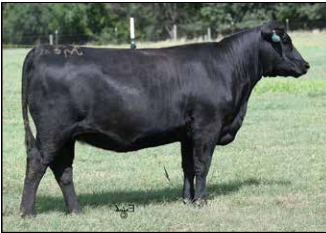
Lot 44 McKellar Proud Formera 0116