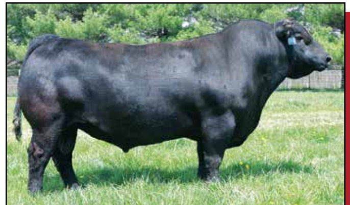
LD Capitalist 316 Reference Sire