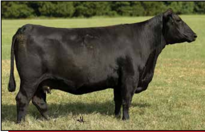
Boka Bay of Conanga 13X Reference Donor