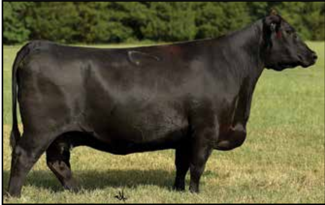
Jais of Conanga 9585 Reference Donor