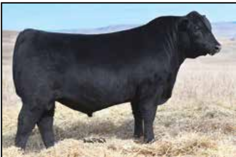
Mill Brae Benchmark 9016

Lot 9 is the pick at weaning of five E.T. daughters of this exceptional female. The buyer will have the opportunity to pick one heifer from any of the fall 2021, spring 2022 flush progeny by this great cow and the following sires: Mill Brae Benchmark 9016 (ABS Global), Tehama Tahoe B767 (Select Sires) & S Powerpoint WS 5503 (ST Genetics).