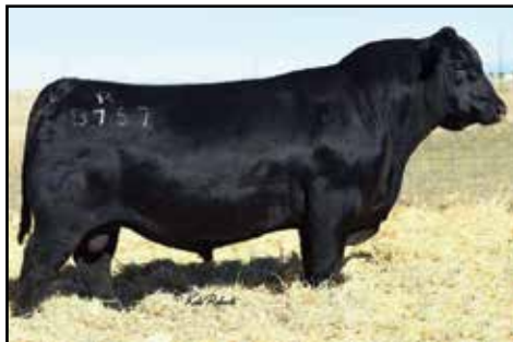
Tehama Tahoe B767