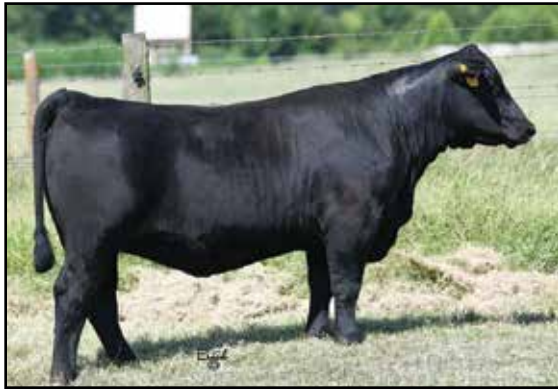
Lot 13 McKellar Barbara 0203

One of the most exciting animals to be sold this season - Phenotype, Power, Potential Lots 15 & 16 are flushmates