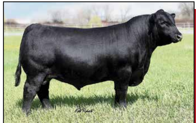
Musgrave 316 Stunner Reference Sire

Great figures on this well muscled Commonwealth Grand dam is the 2009 Connealy Angus Pick of Dams Lots 98 & 101 are flushmates