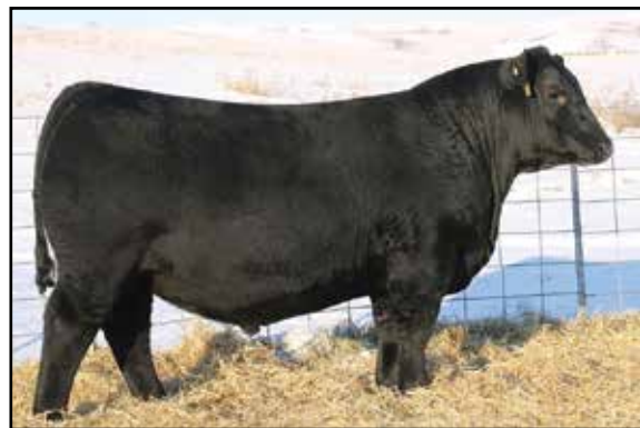
S A V Bloodline 9578 Reference Sire