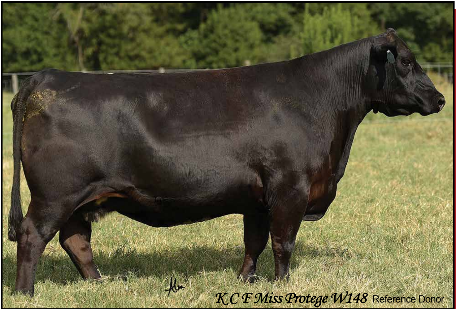
K C F Miss Protege W148 Reference Donor

59 McKellar Barbara 0254 Open Heifer Tattoo:0254 D.O.B.10/11/20 Reg. No.20017635 Barbara S A V Rainfall 6846 #Coleman Charlo 0256 S A V Downpour 8794 S A V Blackcap May 4136 #S A V Madame Pride 4407 #S A V Resource 1441 S A V Madame Pride 0235 #GAR-EGL Protege #Rito 112 of 2536 Rito 616 K C F Miss Protege W148 L B 6807 Isabel 339 Breela of Conanga 3991 #C A Future Direction 5321 Breesha of Conanga 1251