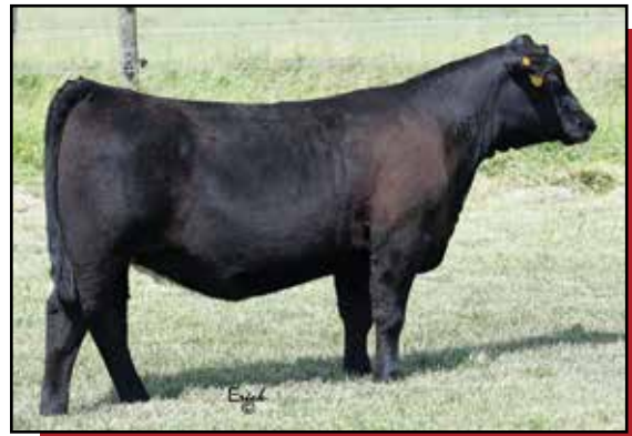
Lot 15 McKellar Blackbird 0290

This wide based, big hipped standout is loaded performance potential with figures to match Lots 12, 13 & 14 are flushmates