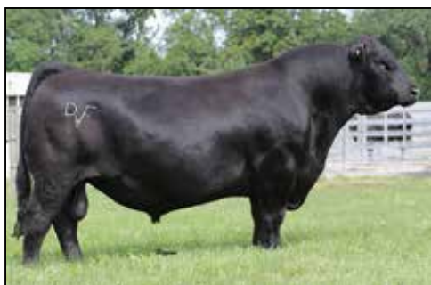
Deer Valley Growth Fund

Lot 53 is the pick of eight E.T. daughters, at weaning, the buyer will have the opportunity to pick one heifer from any of the fall 2021, spring 2022 flush progeny by this great cow and the following sires: Deer Valley Growth Fund (Select Sires), Ellingson Three Rivers (Alta Genetics), and SAV Downpour.